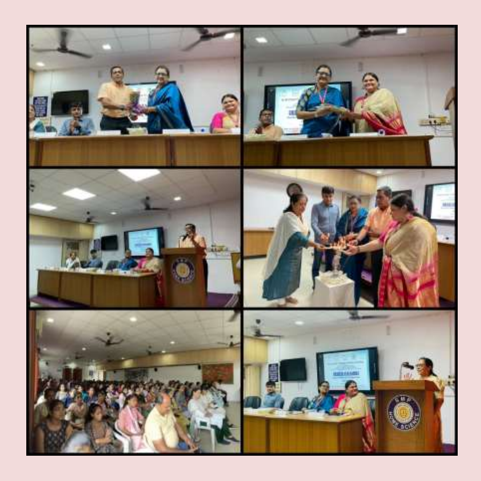
Day-2 (12th July 2023, Wednesday)