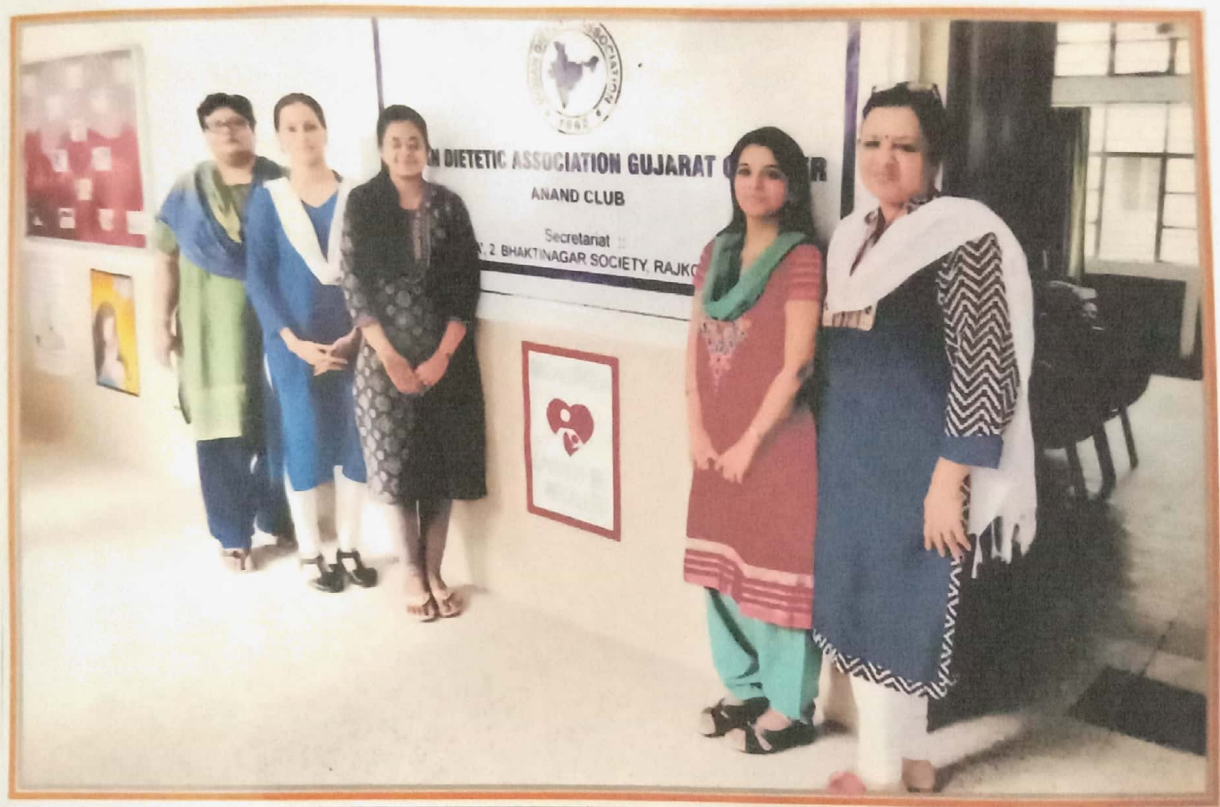
The department of foods and nutrition organized exhibition as a part of Mother's milk week celebration on 8/8/2013 for Anganwadi workers.